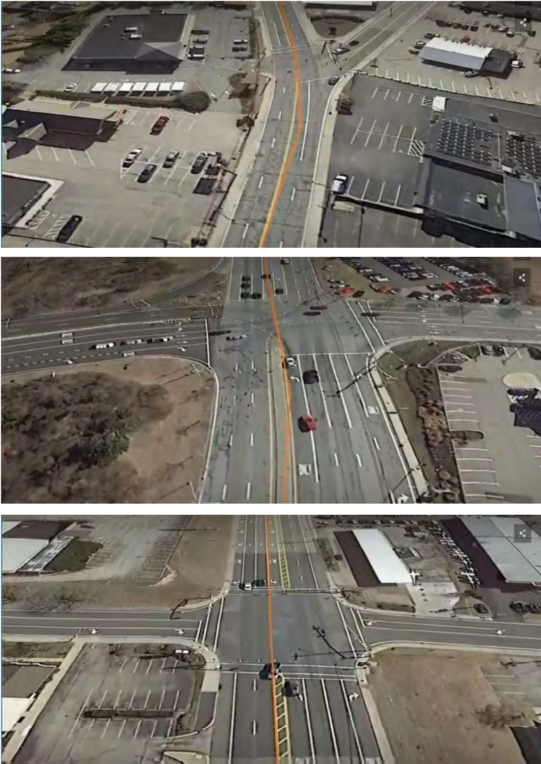
Figure: Still Images of the Project Area Flyover Video