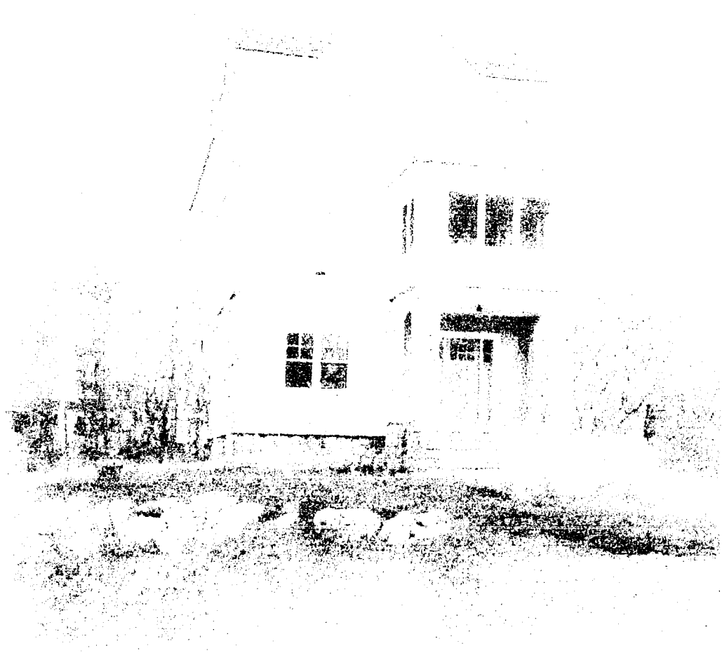
FRONT VIEW 5/7/14

Using the Elevation Certificate to obtain NFIP flood insurance, affix at least 7 building photographs below, according to the instructions in Item A6. Identify all photographs with date taken. "Front View" and "Rear View," and if required "Right Side View" and "Left Side View." When applicable, photographs must show the foundation with representative examples of the Board openings or vents, as indicated in Section A6. If submit no more photographs than will fit on this page, use the contributed Page.