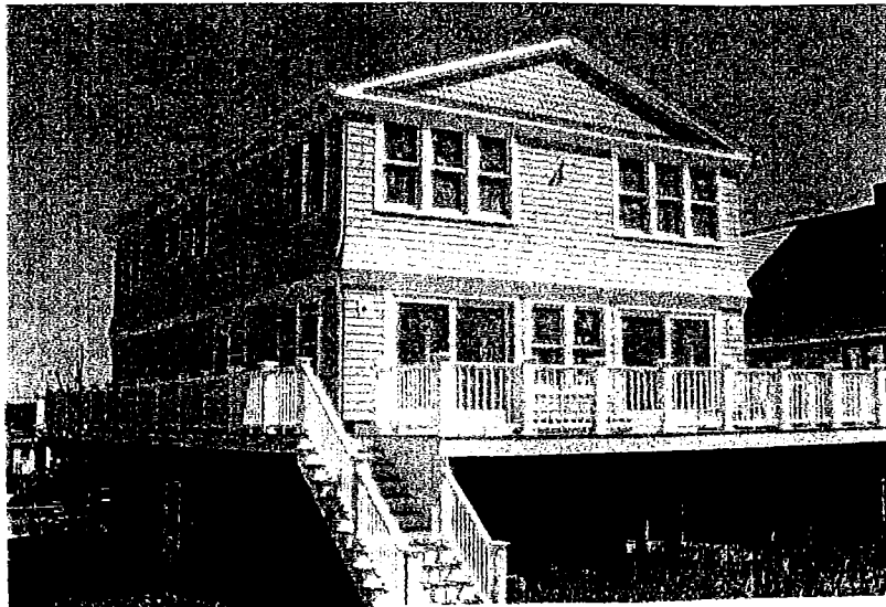
RIGHT REAR VIEW - 6/24/15