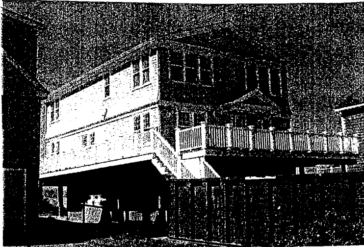
LEFT FRONT VIEW - 6/24/15

If using the Elevation Certificate to obtain NFIP flood insurance, affix at least 2 building photographs below according to the instructions for Item A6. Identify all photographs with date taken; "Front View" and "Rear View"; and, if required, "Right Side View" and "Left Side View." When applicable, photographs must show the foundation with representative examples of the flood openings or vents, as indicated in Section A8. If submitting more photographs than will fit on this page, use the Continuation Page.